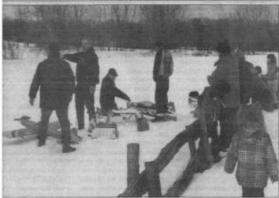
Discussing conditions as the crowd watches the members prepare for takeoff

We hit the big time.We held our annual event at the UPPER CANADA Bird sanctuary. We do this every year and the patrons of the sanctuary really love it and we made it into the paper