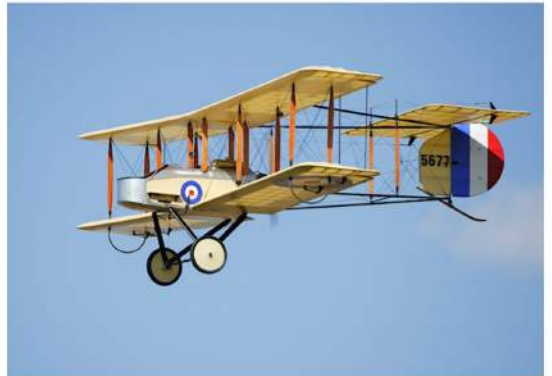
On may 25 and 26 The Rideau Flyers are Holding an open house . I f it is half as good as their web site it should be great