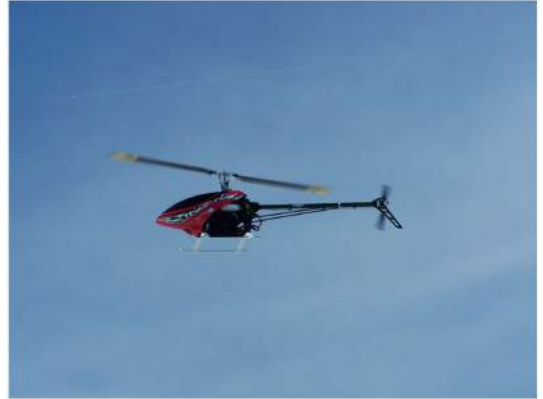
On May 2 ORCC is having a heli fun fly