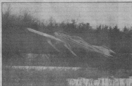
Remote control plane taking off.